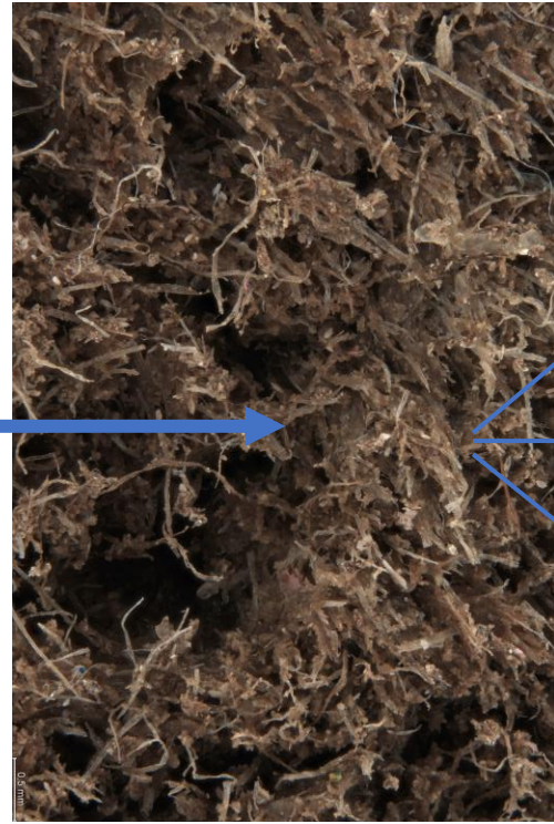
Porosity of cellulose matrix